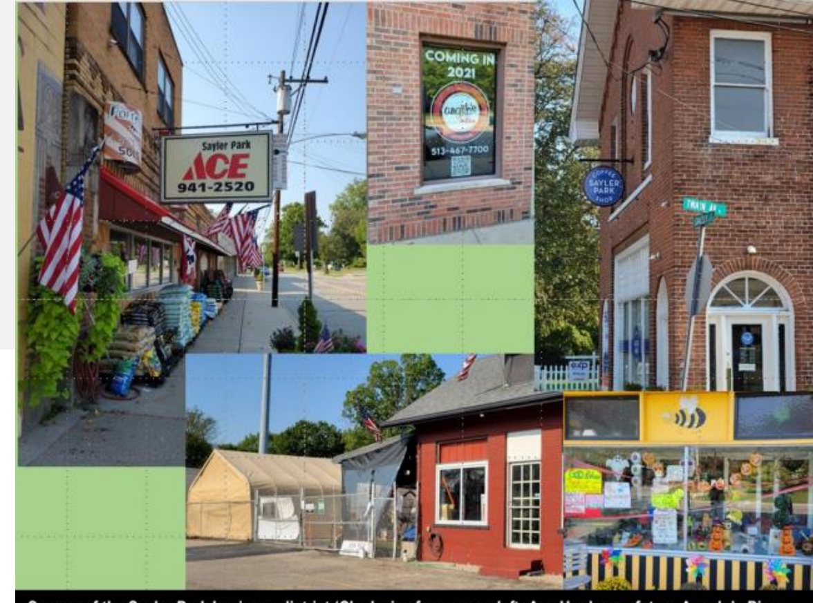
Scenes of the Sayler Park business district (Clockwise from upper left: Ace Hardware, future Angelo's Pizza place, Sayler Park Coffee Shop, Bizy Bee Bakery, annex to hardware store).