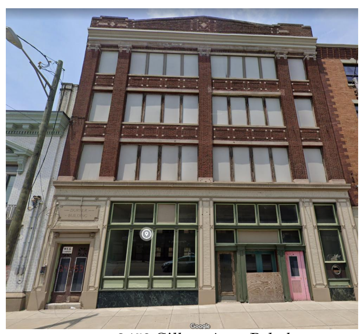
2453 Gilbert Ave - Rehab