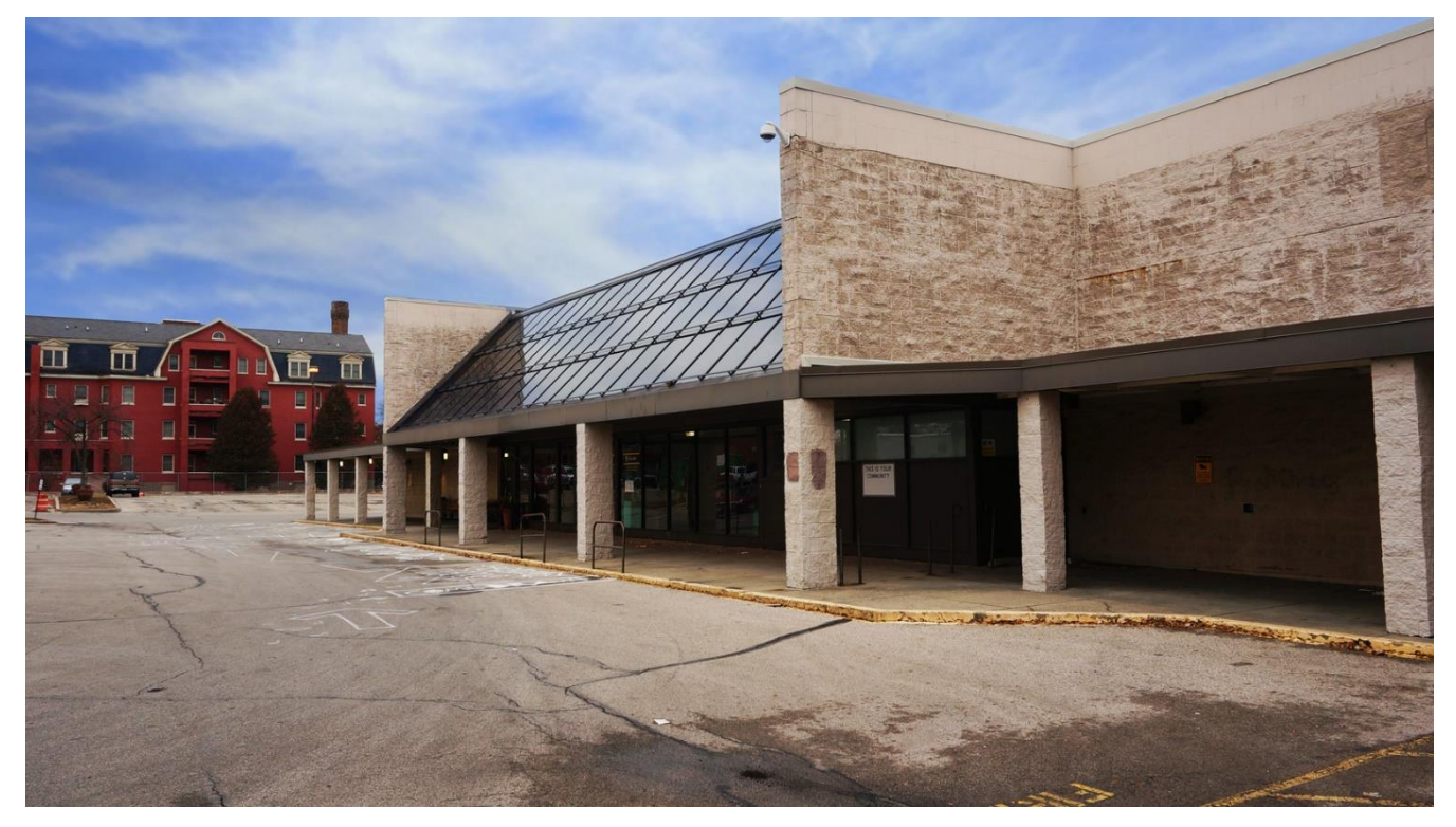
954 E McMillan - New Construction