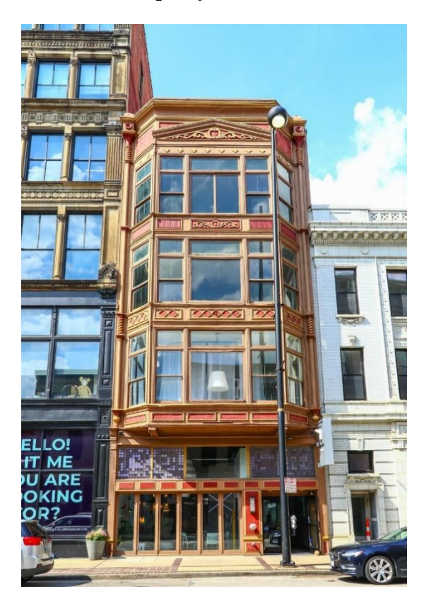
312 W 4th Street