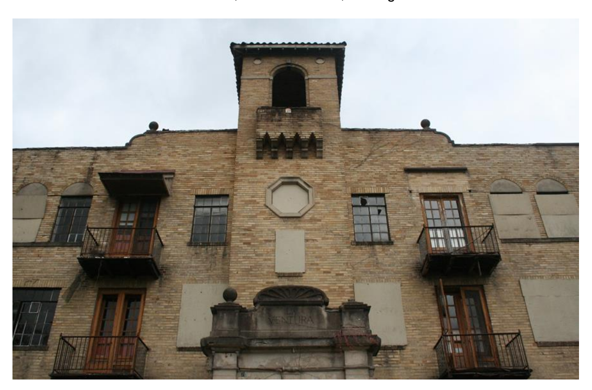
La Ventura, Front Elevation Detail