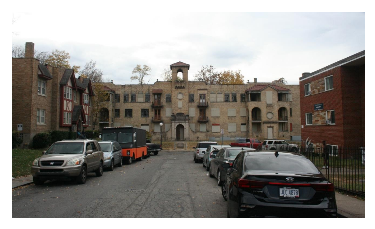
La Ventura, Front Elevation, looking west