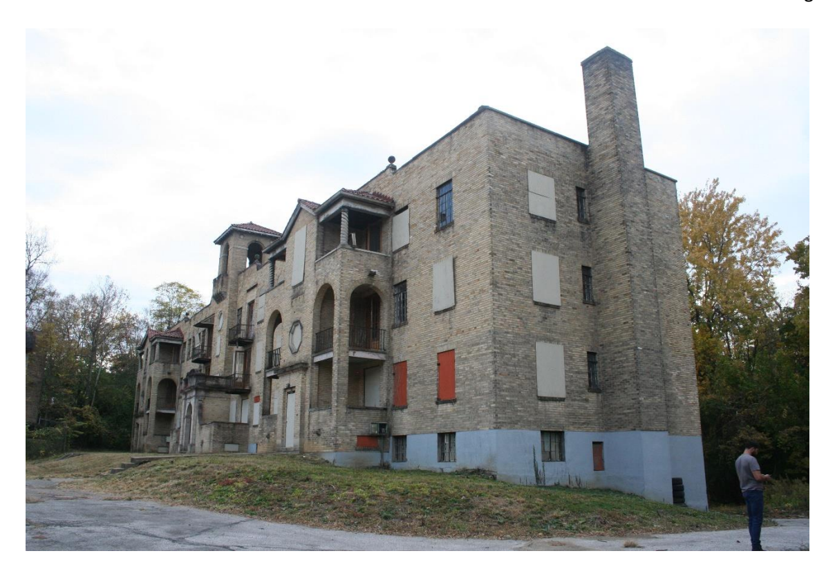
La Ventura, East (Front) and North (Side) Elevations