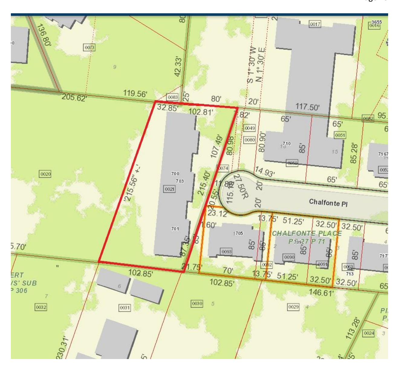
Figure 1. Parcel map, CAGIS, 2022