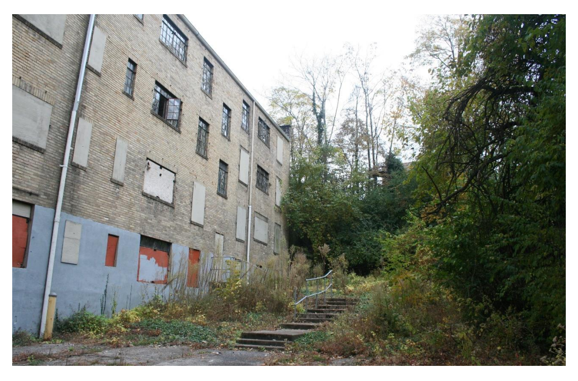
La Ventura, West (Rear) Elevation