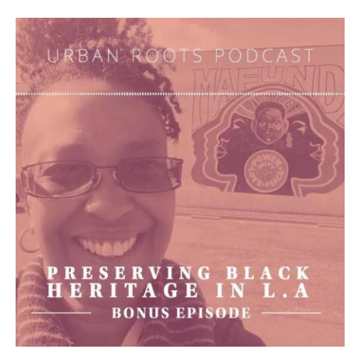
Getty + the Los Angeles City Planning's African American Historic Places Project Los Angeles project has been taking action to identify, protect and celebrate Black heritage since 2018 with their African American historic resources survey and context statement.