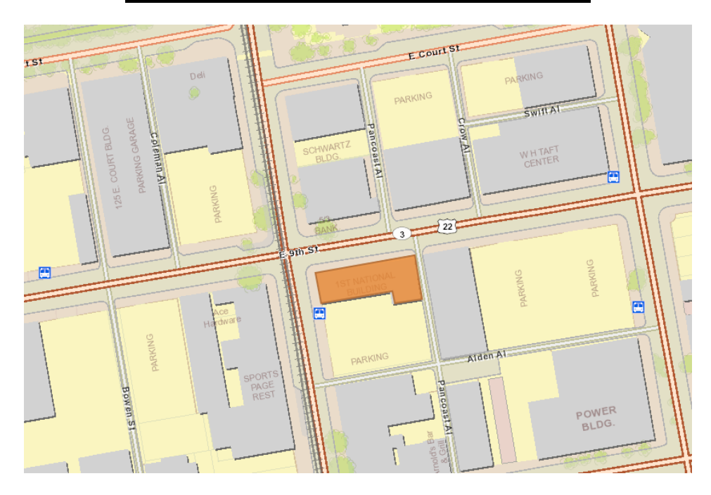
830 Main Street Location