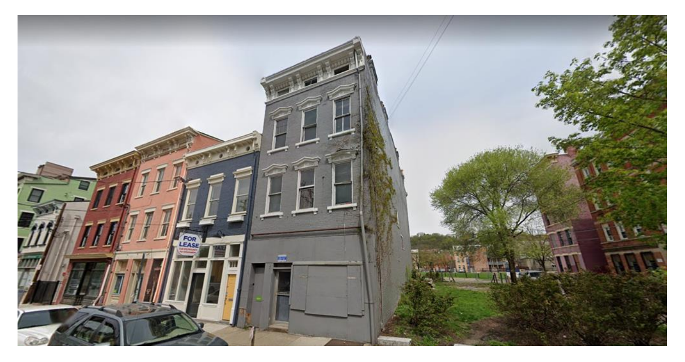
18 W. Elder Street – Current Condition