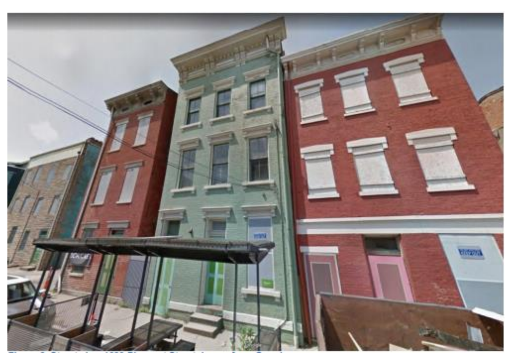
1623 Pleasant Street