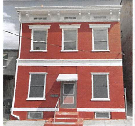
2130 St. Michael Street