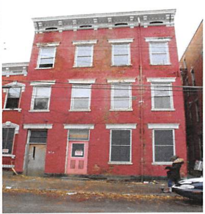
2131 St. Michael Street