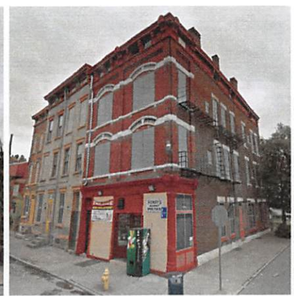
642-646 Neave Street