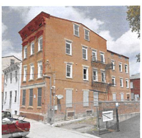
2122 St. Michael Street