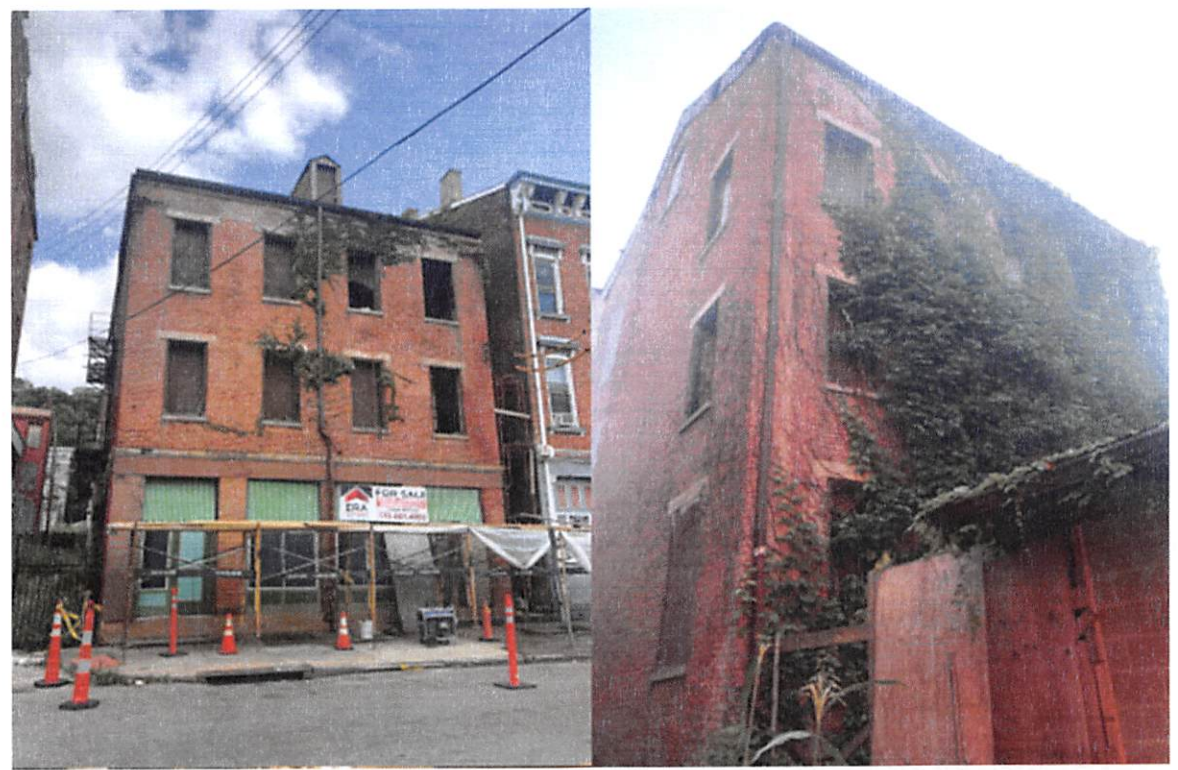
60 E McMicken Avenue