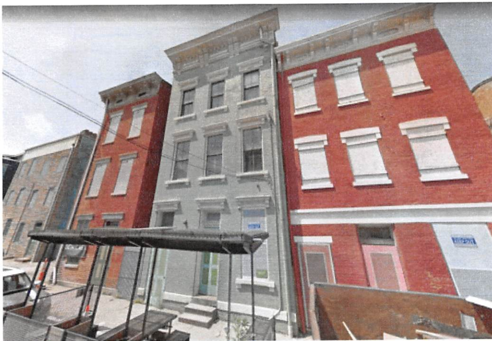
1623 Pleasant Street