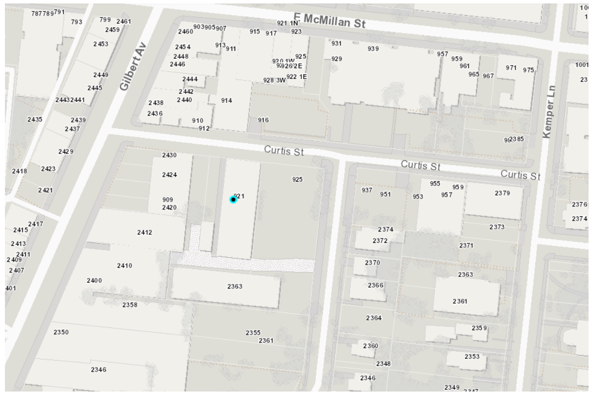
Property Location: 921, 925 Curtis Street and 2363 St. James Avenue