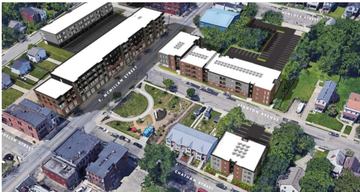
Rendering: Poste Phase I (left) and Poste Phase II (right)