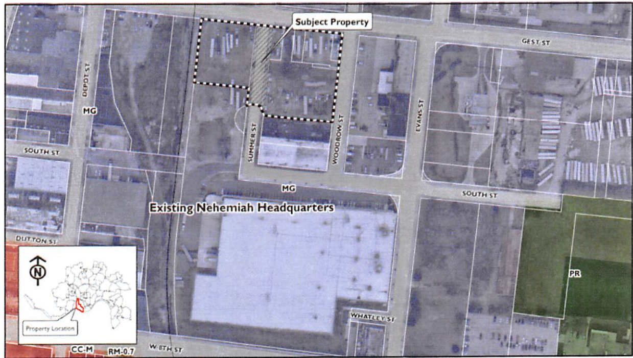
Property Location - 1917-1933 Gest Street.