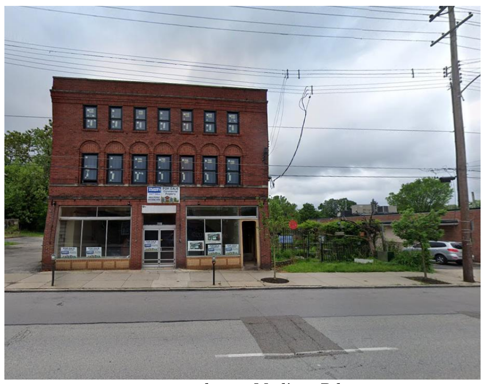
6007 and 6011 Madison Rd.