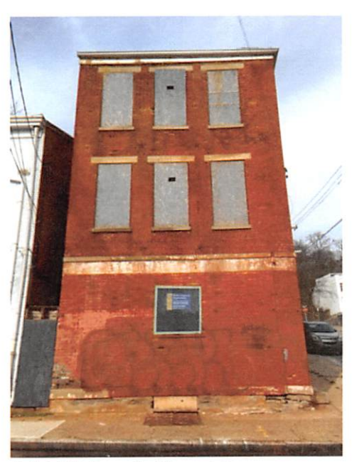
254 Mohawk Street Images