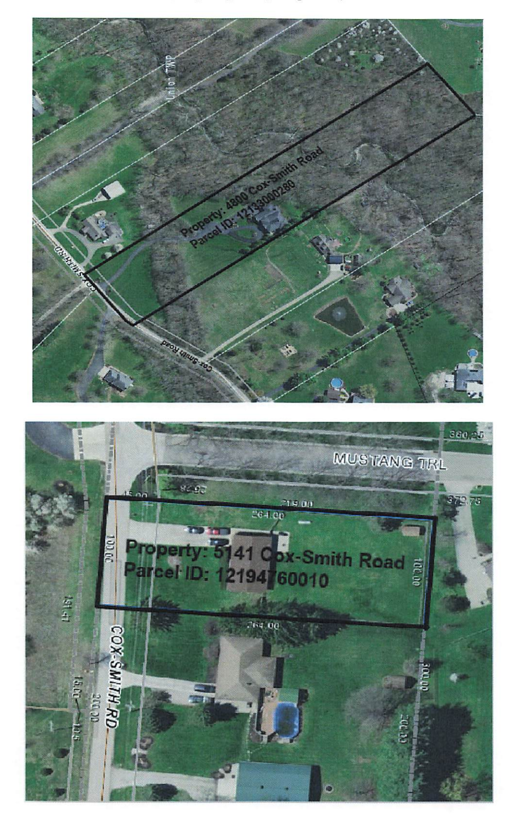
EXHIBIT B To Fifth Amendment to the Warren County Area Contract (Map Depicting Properties)