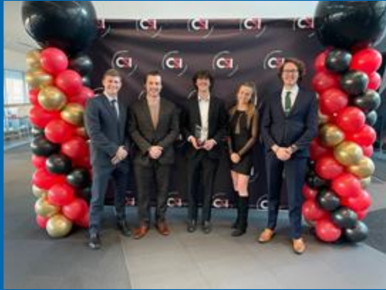
Rookie of the Year (SAB) (2022-2023)