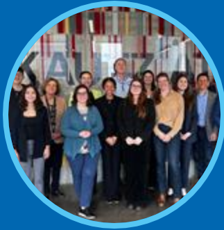
External Advisory Board for Sustainable Business