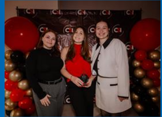
Community Impact Award (SAB) (2024-2025)