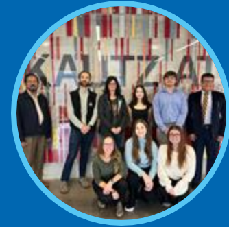
Internal Advisory Board for Sustainable Education