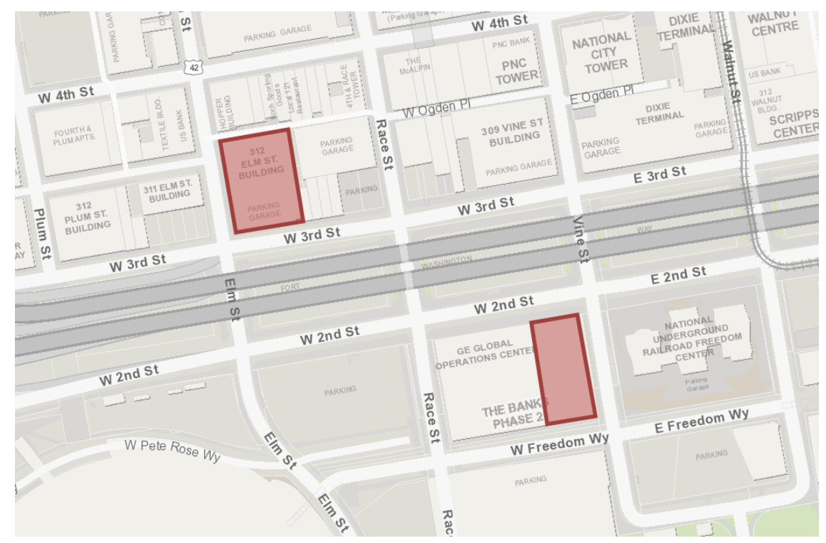
191 Rosa Parks Street and 312 Elm Street