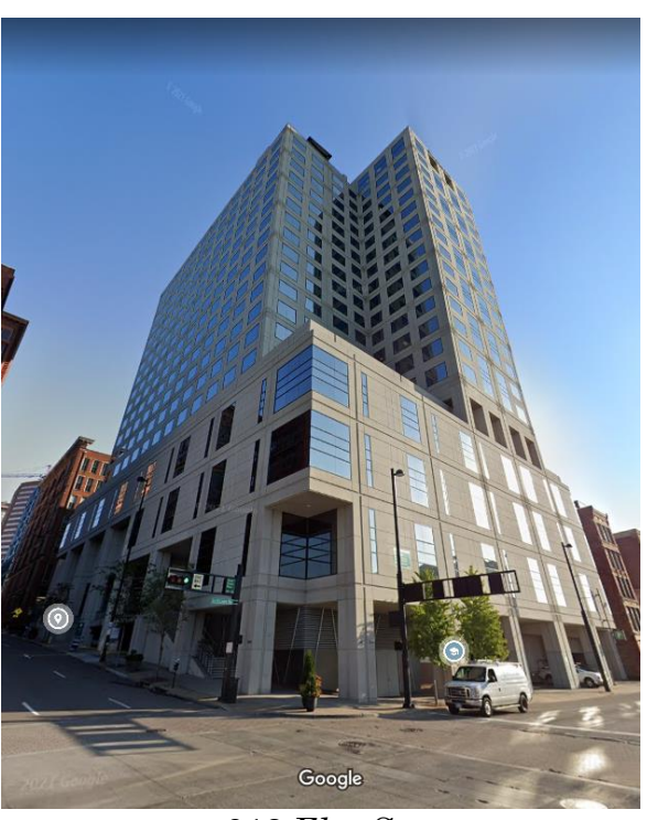
312 Elm Street