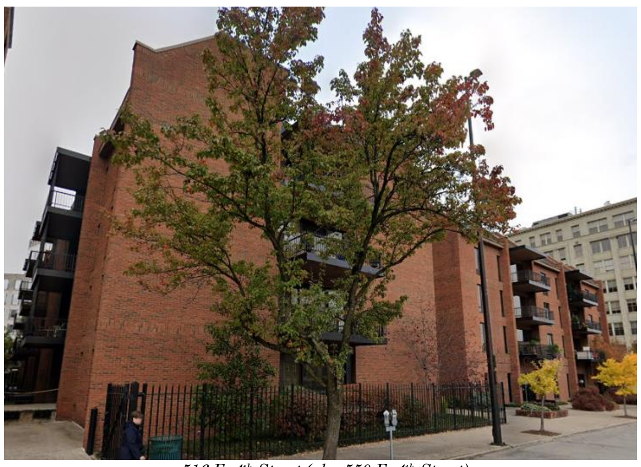
516 E. 4th Street (aka 550 E. 4th Street)